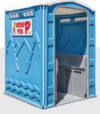
Portable Urinals & Walkthrough P Pens

Most suitable for long-term use on sites with sewer and mains water supply readily available. Modern solid plastic construction ventilated for maximum user comfort.