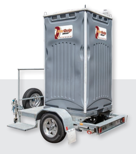
Trailer Mounted Toilets Single, Double Or Shower Combo

Easy to tow and transport showers or toilets from our fleet. Saves on transport costs especially if towing to remote locations. Very easy to manoeuvre.